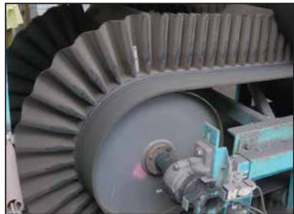
Side wall Belt