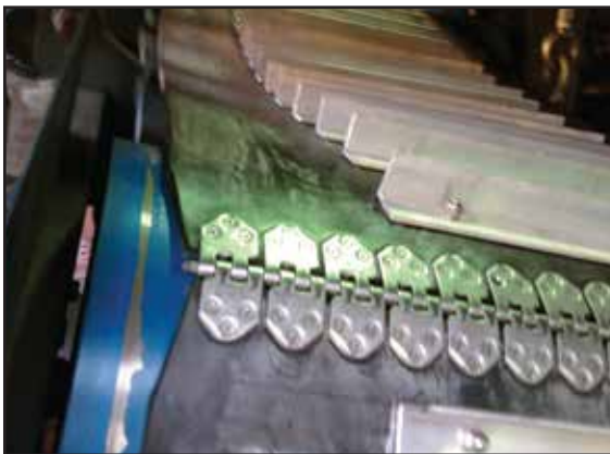
Magnetic separator belts