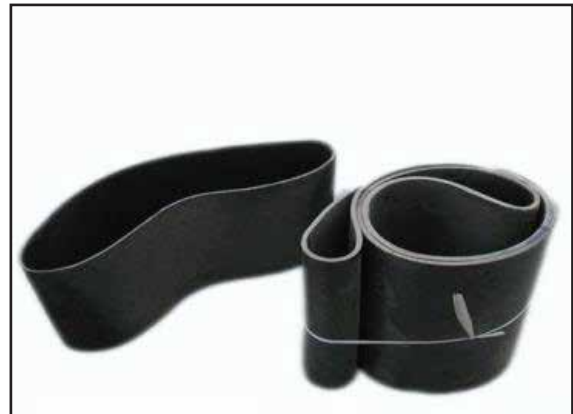
Truly endless belts